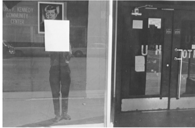
Lee Friedlander, "Colorado," 1967.