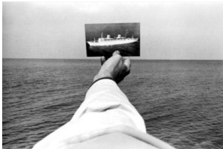
Kenneth Josephson, "New York State," 1970